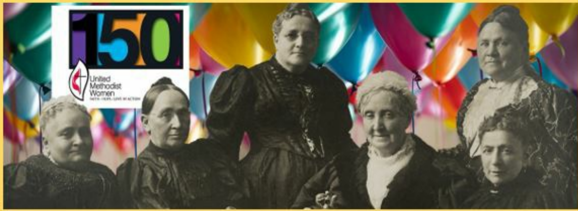
Founders of the Methodist Woman's Foreign Missionary Society - 1869

October 5 th 11 a.m. - UMW Fall Luncheon "Celebrating Our Legacy"